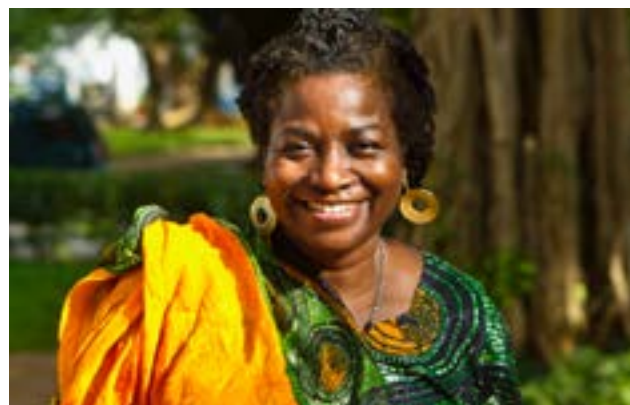
Dr. Natalia Kanem, Under-Secretary-General of the United Nations and Executive Director of UNFPA

as well as strategies and program implementation. UNFPA's capabilities in collecting, analyzing and disseminating this