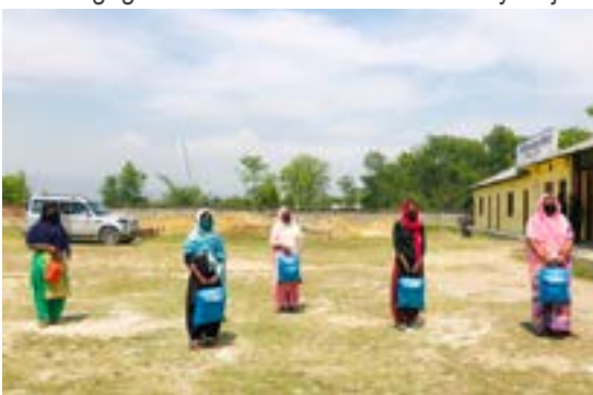
Girls and Women receiving kits during the COVID-19 pandemic in Madagascar @UNFPAMadagascar

Dr. Kanem pledged UNFPA support to Madagascar in ending maternal mortality, including through ongoing programs on capacity building of health workers – particularly mid-wives and nurses.