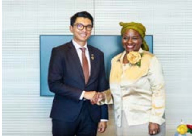
H.E. President Andry Rajoelina of Madagascar and Dr. Natalia Kanem, Under-Secretary-General of the United Nations and Executive Director of UNFPA

President Rajoelina commended Dr. Kanem and UNFPA for the impactful programming undertaken in Madagascar and requested further support in addressing the unmet need for family planning, citing the fact that the Malagasy woman has on average 5-6 children. He indicated that this resulted in high malnutrition rates, further linked to school dropouts. Consequently, Madagascar has formulated a National Plan addressing malnutrition that seeks to reduce malnutrition by 50%.