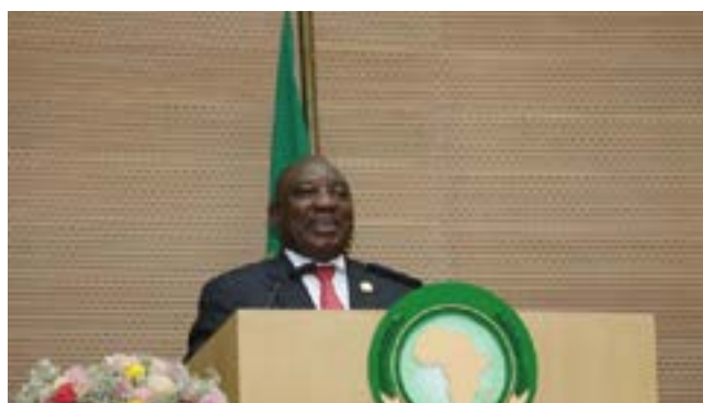
H.E. President Cyril Ramaphosa, President of South Africa and Chairperson of the African Union for 2020 speaking during the AU Assembly 2020

Some of the significant decisions made in this year’s Summit included the recommitment of the African Union to ending all forms of Sexual and Gender Based Violence against women and adolescents girls in Africa and ensuring increase in uptake of Sexual Reproductive Health Services. This was signified by the decision of the African Union to continue with the continental campaign against Female Genital