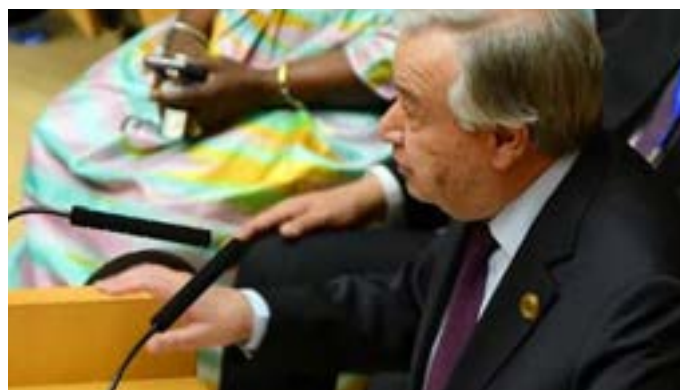
Antonio Guterres, United Nations Secretary General Speaking at the African Union Assembly 2020

In line with the ongoing efforts by the AU to ensure inclusion of women in Africa's development agenda, the African Union declared 2020 to 2030 as the Decade of Financial Inclusion for Women. This is a significant and welcome development, as it will go a long way in addressing very prevalent financial exclusion affecting millions of women and other marginalized populations in the continent. Financial inclusion is a key