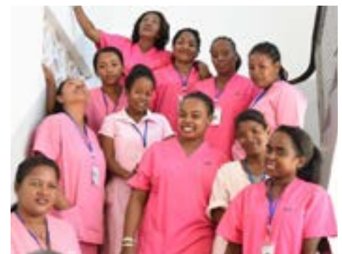
Nurses and Midwives working on the forefront during the pandemic @UNFPAMadagascar