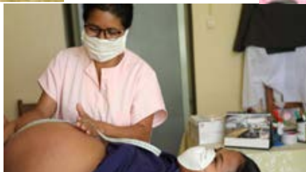
Midwives keeping mothers in the front and center for maternal care during the COVID-19 Pandemic @UNFPAMadagascar